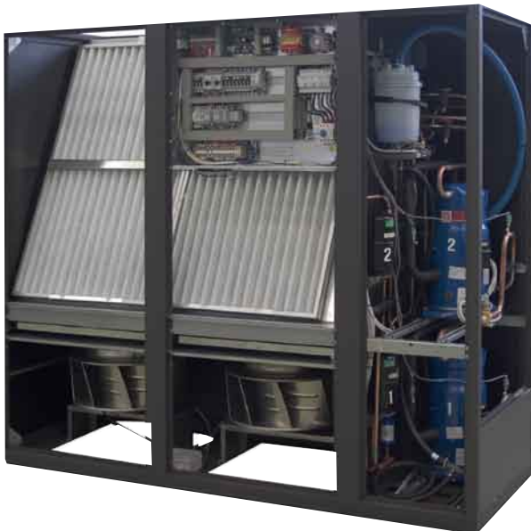
Downflow unit with 2 fans and side compartment; full front access for both fans (not covered) and technical compartment on the side. No side maintenance space is required for accessing components.