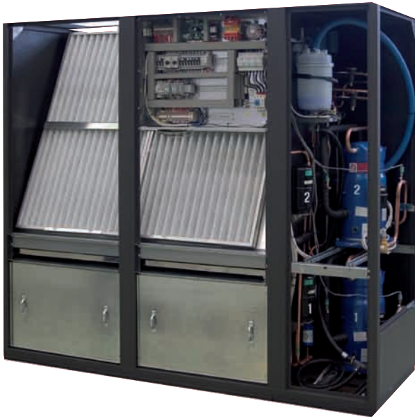
Downflow unit with 2 fans and side compartment; full front access for both fans (covered) and technical compartment.