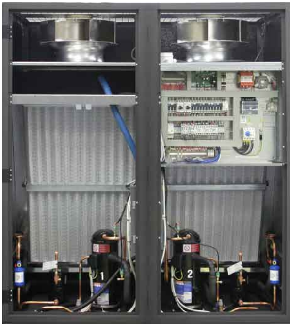
50 kw upflow 2 circuits direct expansion air conditioner

Units in "two seasons" cannot install the optional hot water heating coil, only the electric one, and have as standard the analogue modulating controller.