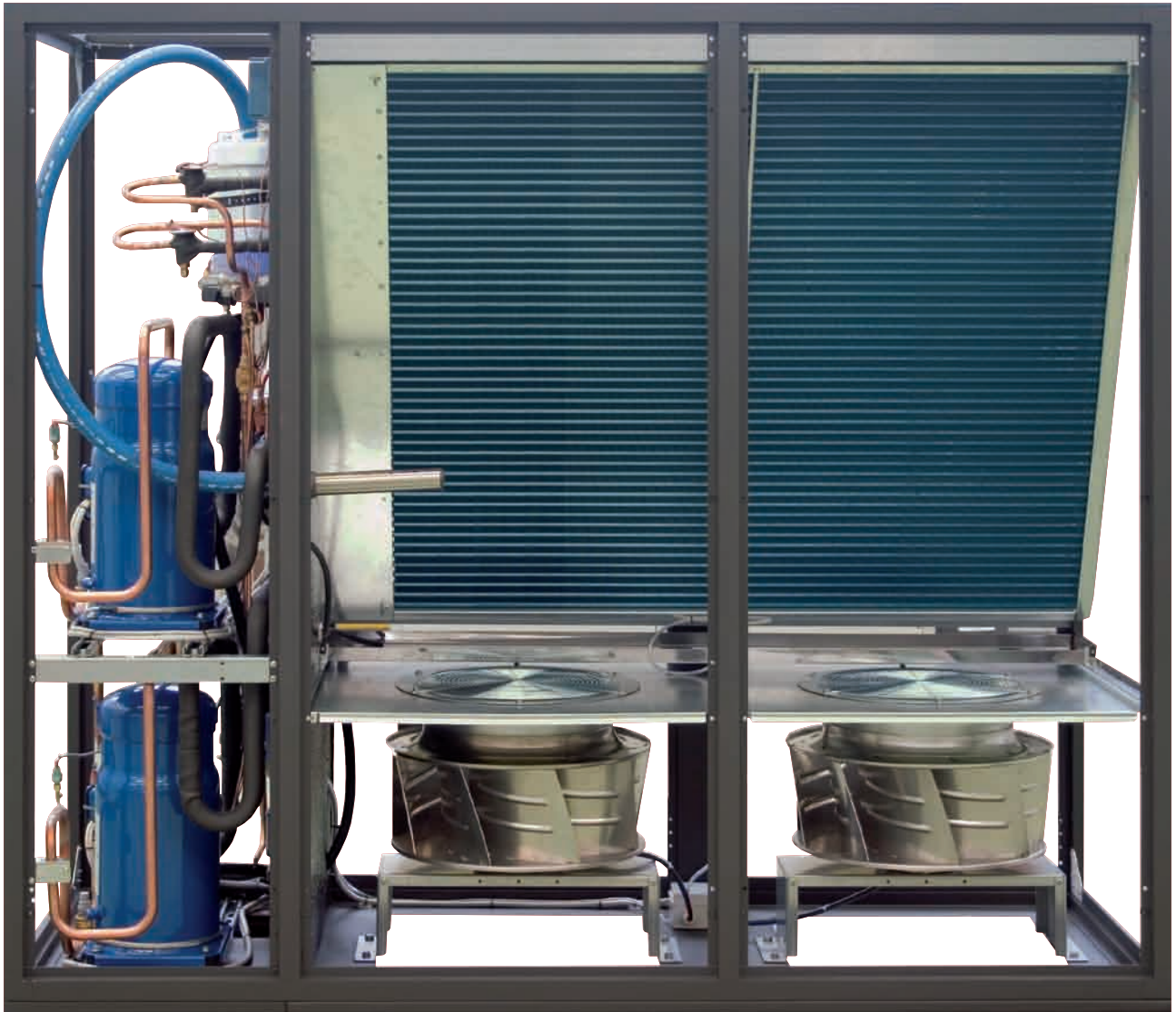
Rear view of twin fan unit (shown without casing)