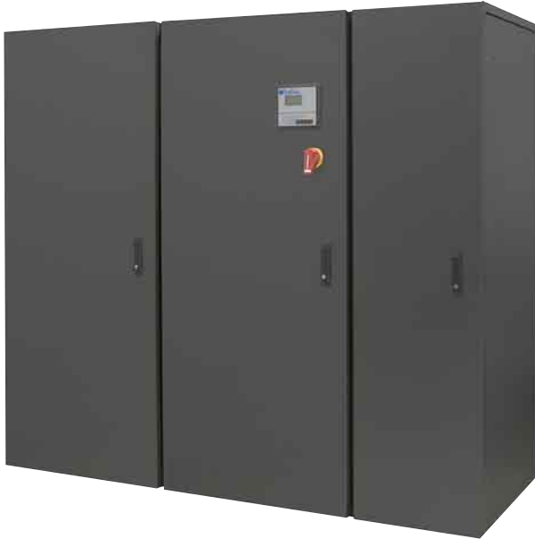
YORK® YC-C 'downflow' 3 fan unit